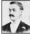
George Washington Gale Ferris Jr. (1859 - 1896)

We will create and use fact file databases in Computing.