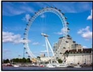
The London Eye (2000)

In DT we will explore how frames are reinforced and build a model shelter. We will also investigate pulleys and gears and design our own moving products.