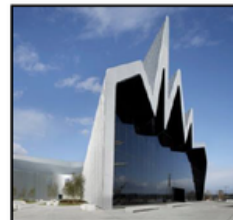
The Riverside Museum, Glasgow (2011)