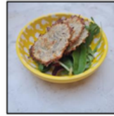
Root vegetable rasti

Design & Technology - We will learn how to make healthy foods using low-cost ingredients and explore how food choices can affect our health.