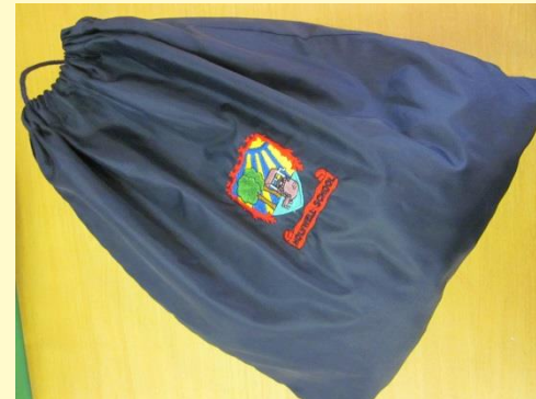
Drawstring bag to be kept in school with some spare clothes/pants inside.