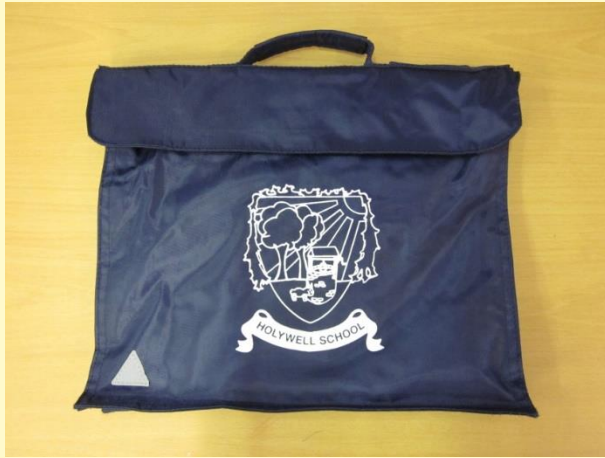
School book bag.